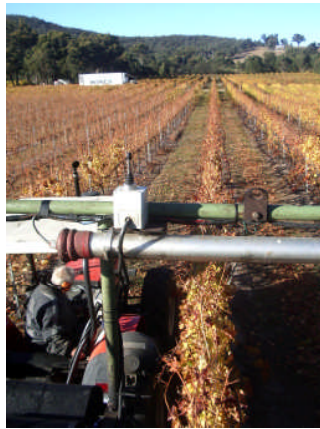
The view from atop the machine harvester during late Autumn and Cabernet Sauvignon picking

Chardonnay, Sauvignon Blanc and Semillon produced moderate crops with concentrated varietal characters and clean flavours. The Pinot Gris reached its usual high maturity levels, which enables us to make the full bodied Pinot Gris style Cuttaway has received many accolades and awards for in past vintages.